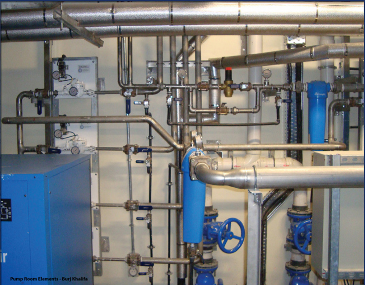
Pump Room Elements - Burj Khalifa