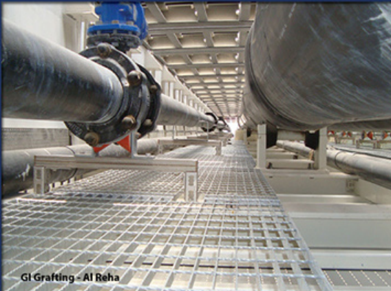
GI Grafting - Al Reha