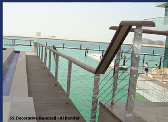
SS Decorative Handrail - Al Bandar