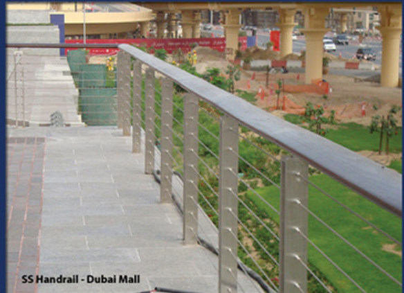
SS Handrail - Dubai Mall