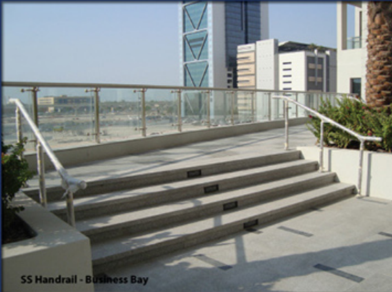
SS Handrail - Business Bay