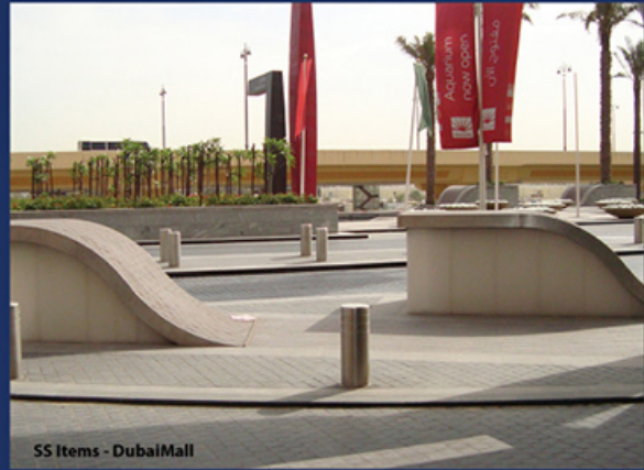
SS Items - Dubai Mall