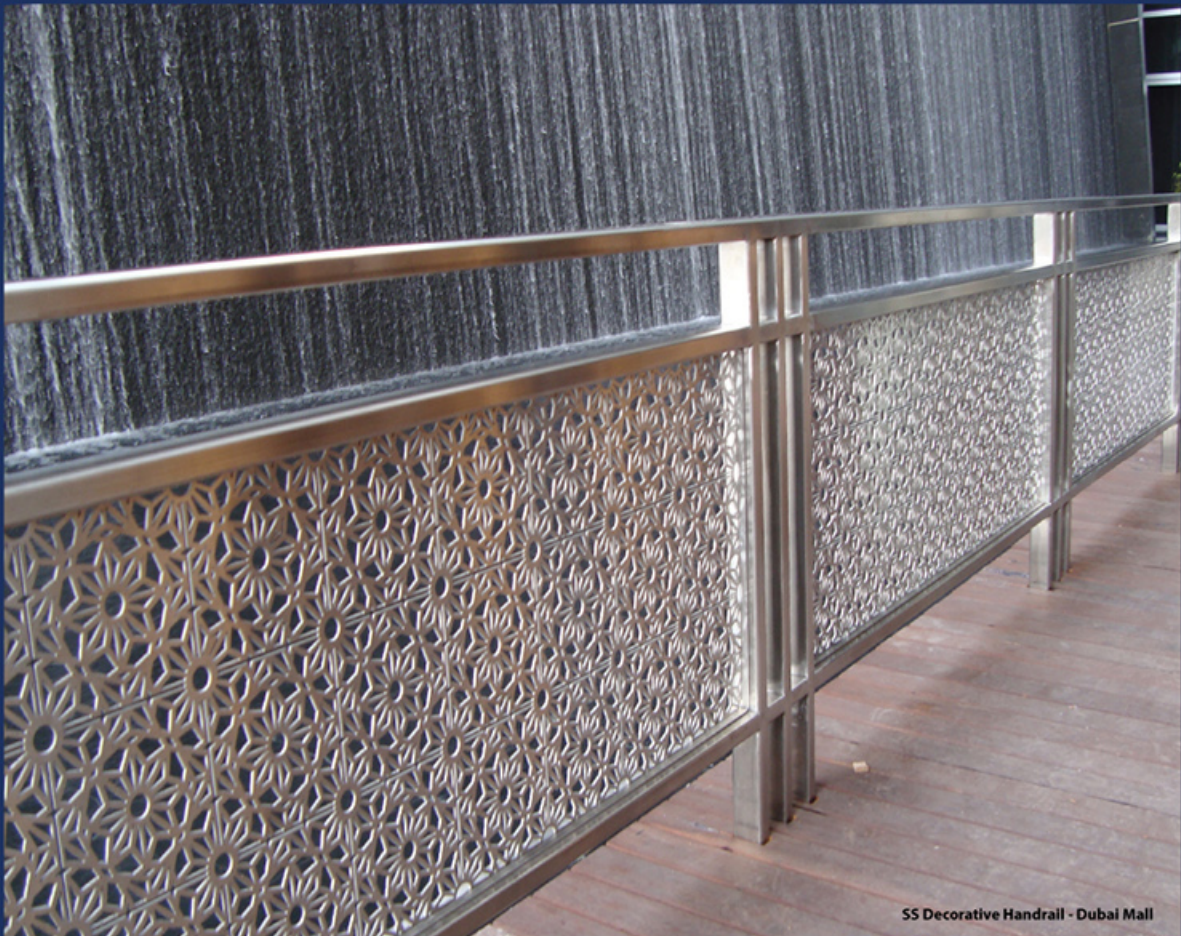
SS Decorative Handrail - Dubai Mall