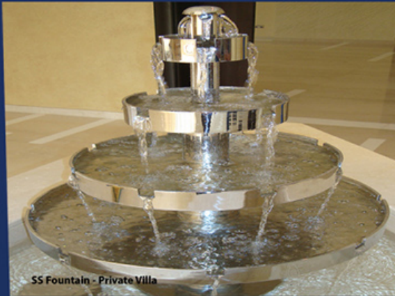
SS Fountain - Private Villa