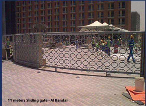
11 meters Sliding gate - Al Bandar