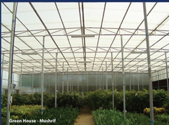
Green House - Mushrif