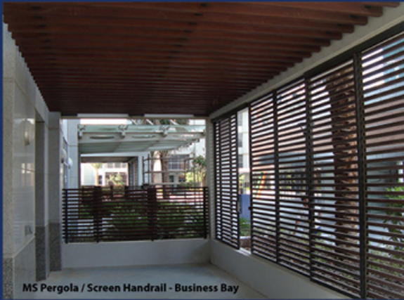
MS Pergola / Screen Handrail - Business Bay