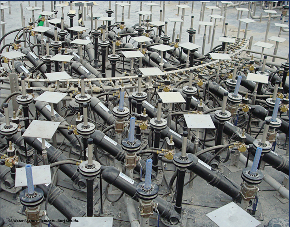
SS Water Feature Elements - Burj Khalifa