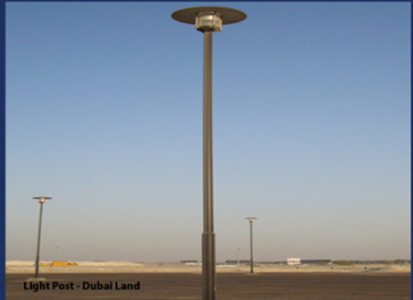
Light Post - Dubai Land